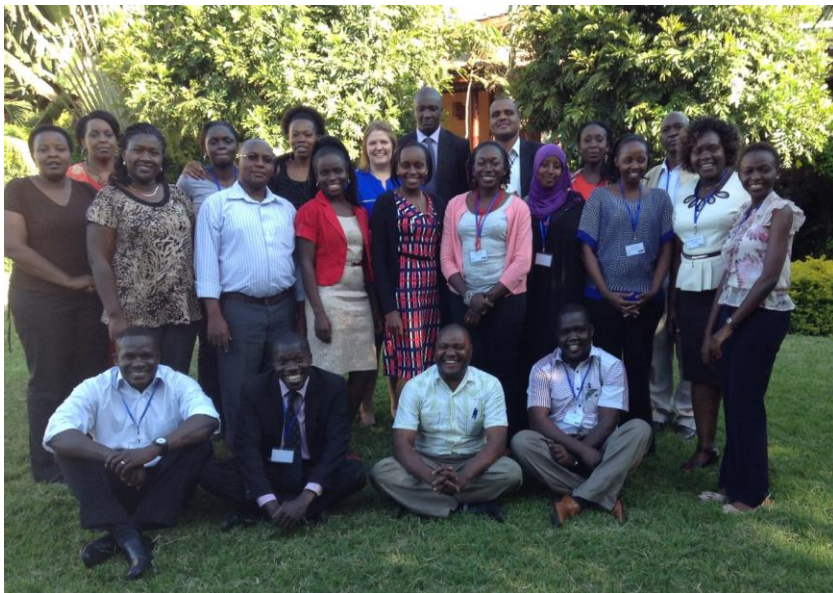
Participants and facilitators of SUN CSA Nutrition Advocacy Training.