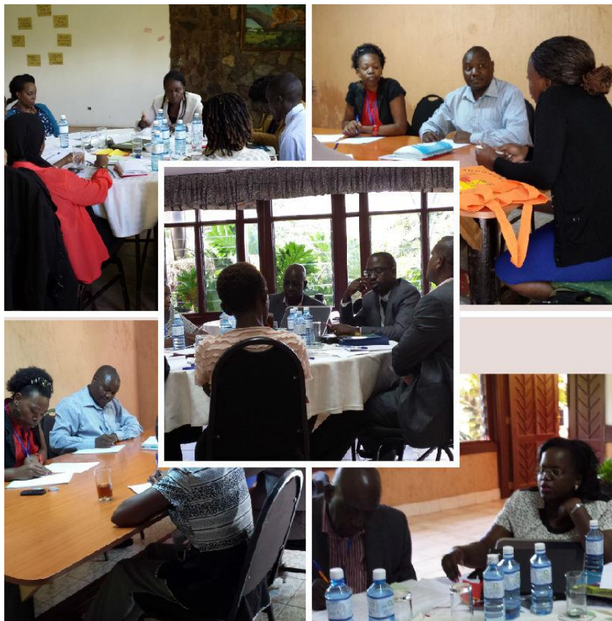
Different sessions of SUN CSA Nutrition Advocacy Training.