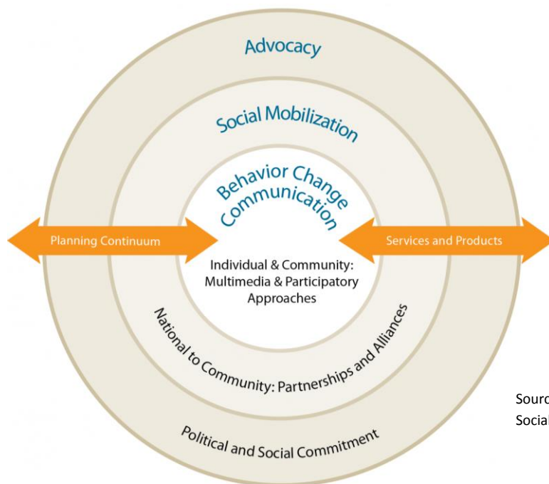
Figure 2: SBCC Approach

Source: Adapted from McKee, N. 1992. Social Mobilization and Social Marketing in Developing Communities.