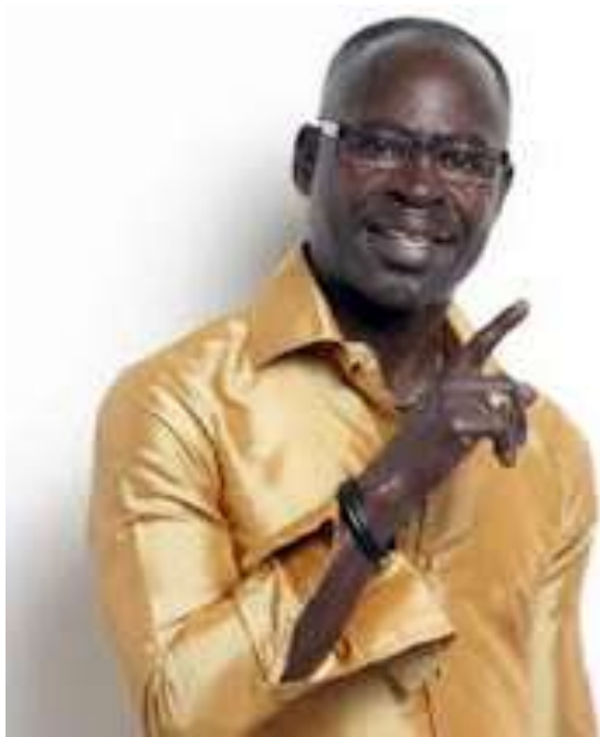
Abrantie Amakye Dede