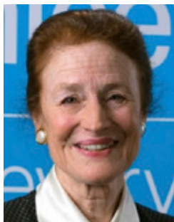
Henrietta H. Fore , Executive Director of UNICEF and Chair of the SUN Movement Lead Group