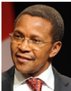
Jakaya Kikwete , former President of Tanzania