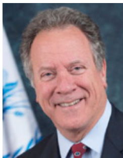
David Beasley , Executive Director of the World Food Programme (WFP)