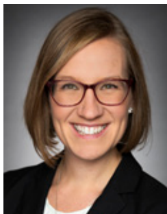
Karina Gould , Minister of International Development, Government of Canada