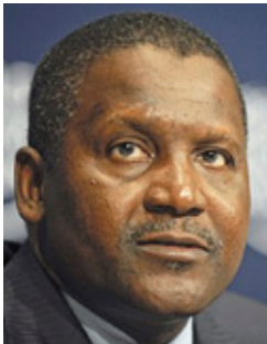
Aliko Dangote , Chairman and CEO of Dangote Group