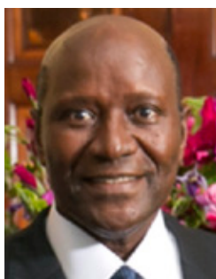
Daniel Kablan Duncan , former Vice President of Côte d'Ivoire