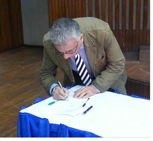
NGOs Representative signing the Declaration of Commitment