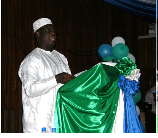
The Deputy Minister of Finance and Economic Development