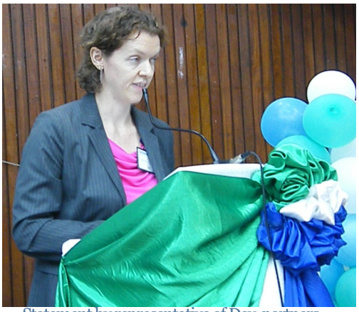
Statement by representative of Dev. partners