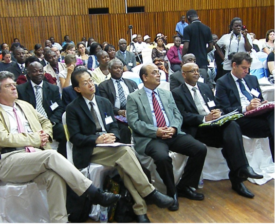
Stakeholder and development Partners at the ceremony

SUN Initiative is a global movement that brings together broad constituencies of stakeholders in a partnership with shared vision to address malnutrition. Sierra Leone joined the SUN Movement in February 2012 and has appointed the Vice President as the national SUN focal person and the First Lady as a champion. The Movement is supported locally by the government, NGOs, United Nations system, donors, Civil Society Organizations and the private sector.