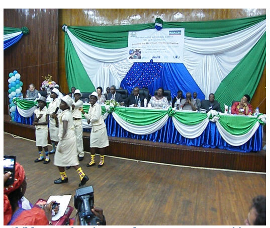
Children performing an advocacy song on nutrition