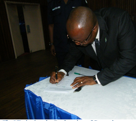
The VP signing the Declaration of Commitment