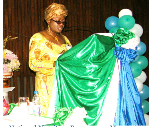
National Nutrition Programme Manager