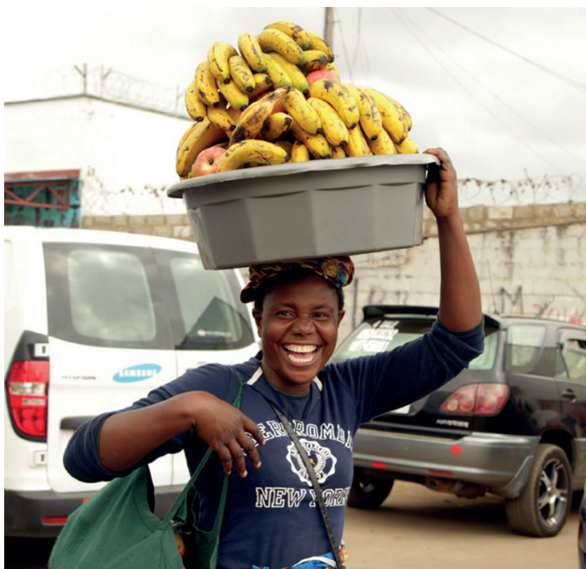
for Zambia Civil Society Organization Scaling Up Nutrition (CSO-SUN) Alliance Global Day of Action 2014

The SUN CSN secretariat is resourced through two grants from the Multi-Partner Trust Fund running through December 2015 as well as a contribution from Save the Children UK, who host the SUN CSN Secretariat.