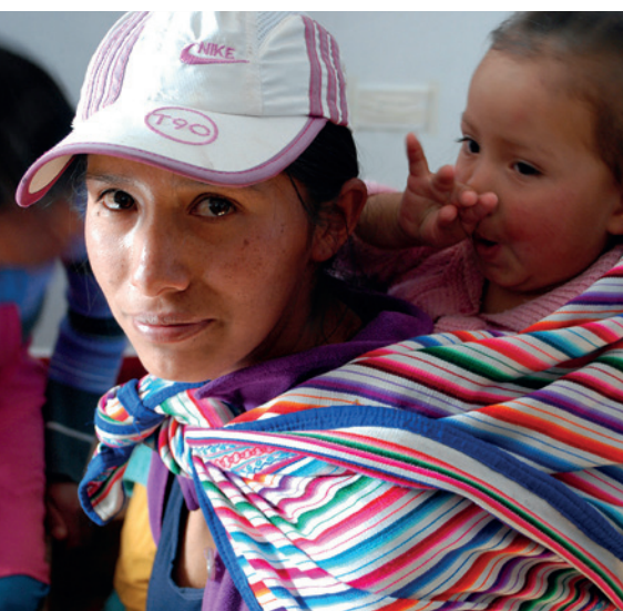
A mother and her baby at a child centre in Peru.