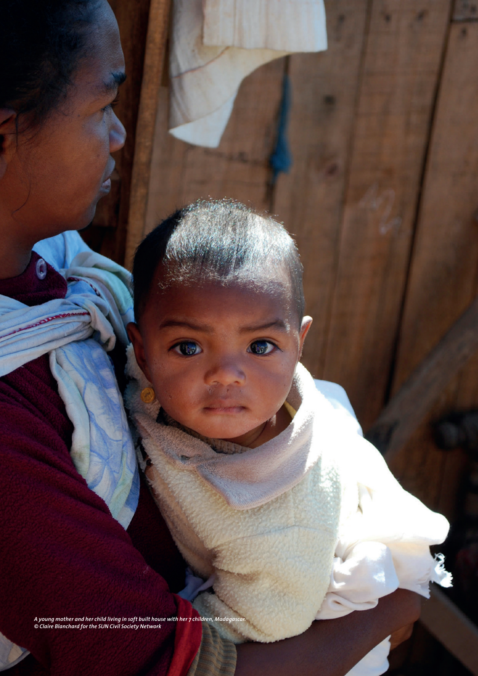
A young mother and her child living in soft built house with her 7 children, Madagascar.