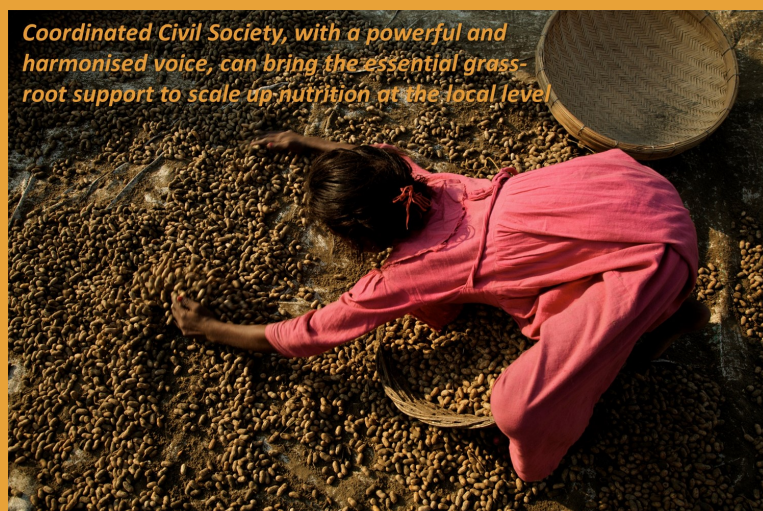
Coordinated Civil Society, with a powerful and harmonised voice, can bring the essential grass-root support to scale up nutrition at the local level

As of January 2014, there are Civil Society Alliances in 29 SUN countries (Bangladesh, Benin, Burkina Faso, Côte d'Ivoire, El Salvador, Ethiopia, Ghana, Guatemala, Guinea, Indonesia, Kenya, Kyrgyz Republic, Lao PDR, Madagascar, Malawi, Mali, Mozambique, Myanmar, Nepal, Niger, Nigeria, Peru, Senegal, Sierra Leone, Sri Lanka, Tanzania, Uganda, Zambia, Zimbabwe) at various stages of CSA establishment and activity. Of these 29 alliances, 24 alliances are funded either through the SUN multi-partner trust fund (MPTF) or through bi-lateral donors (DFID, Irish Aid).