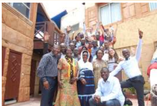
Group Photo ACF Advocacy training for Nutrition Champion Dakar, Senegal – Sep 2-6, 2013

Multi-Partner Trust Fund call for applications - opening soon. Watch this space!