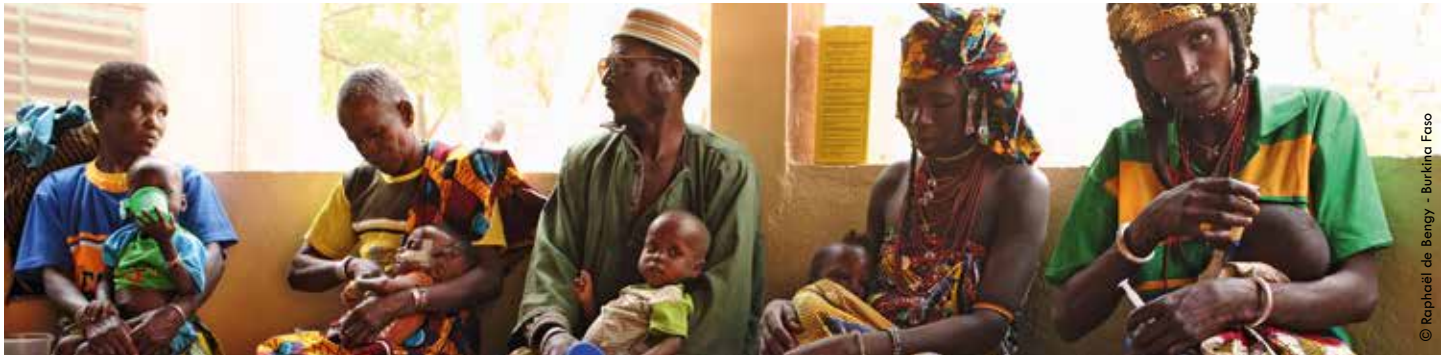
© Raphaël de Bengy - Burkina Faso