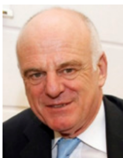
David Nabarro , Strategic Director, 4SD

Dr David Nabarro is Co-lead of the Food Workstream of the UN Secretary General's UN Global Crisis Response Group on Food, Energy and Finance and Special Envoy on Covid-19 for the World Health Organization.