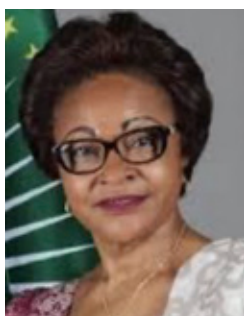
Josefa Leonel Correia Sacko , Commissioner for Agriculture, Rural Development, Blue Economy and Sustainable Environment, African Union Commission