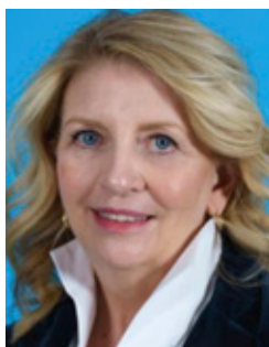
Catherine M. Russell , Executive Director, UNICEF