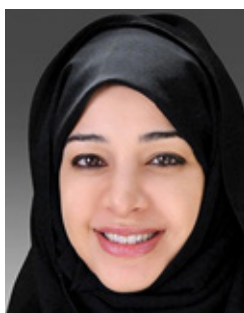
Reem Al-Hashimi , Cabinet Member and Minister of State for International Cooperation