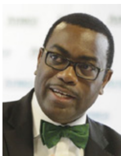
Akinwumi Ayodeji Adesina , President, African Development Bank