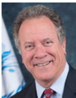
David Beasley , Executive Director, World Food Programme