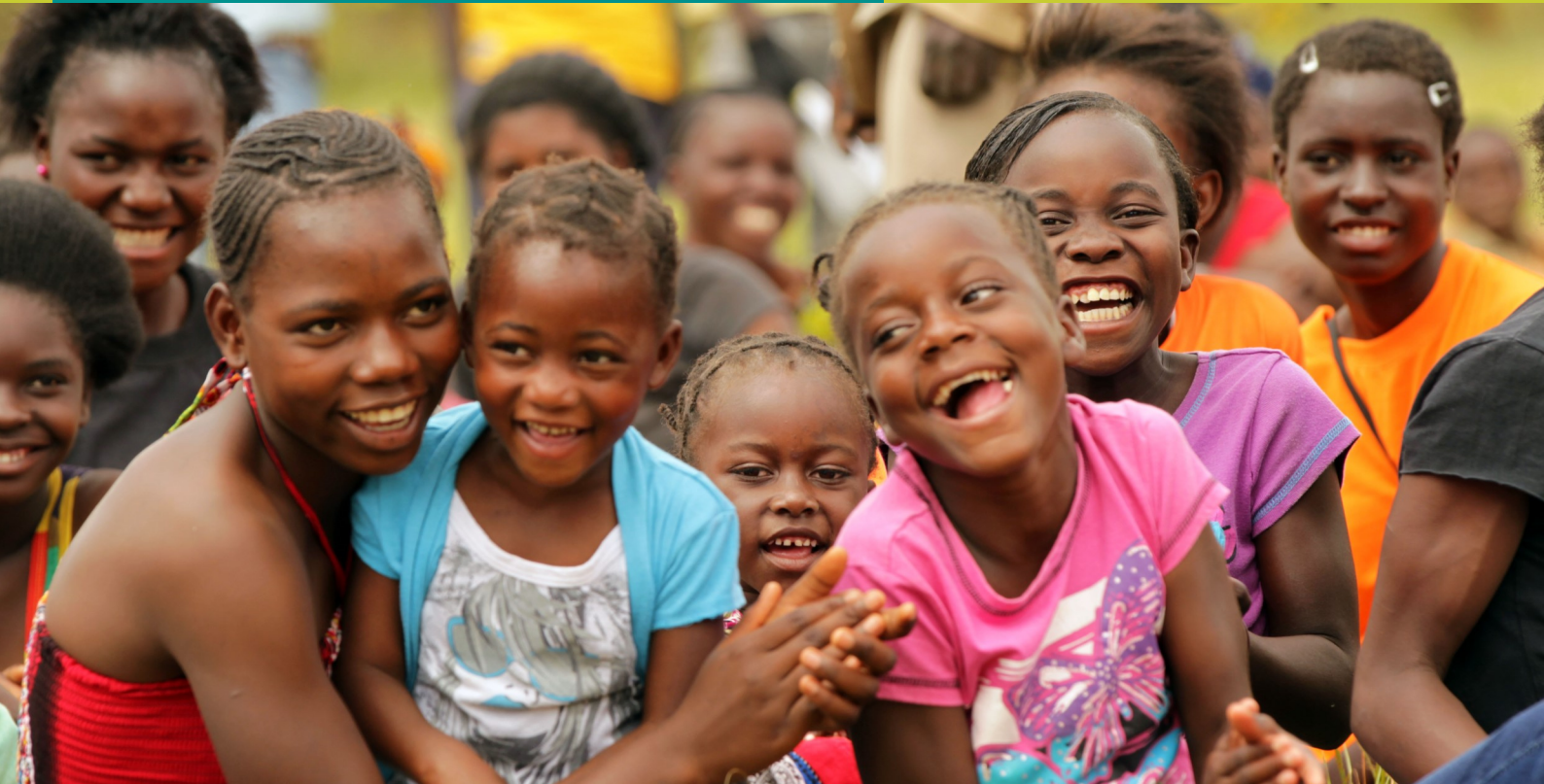
Photo Credit—Zambia Civil Society Organization Scaling Up Nutrition (CSO-SUN) Alliance - Global Day of Action 2014

In May 2014, the second Global Day of Action (GDA) saw momentum increasing as a result of an ever vibrant, active civil society community for scaling up nutrition that is steadily growing across the globe. Twelve civil society alliances coordinated actions in support of the 'Global Day of Action' calling upon their own governments and others around the world to prioritise nutrition. Their activities included public marches, concerts, soccer tournaments and community gardening activities as well as parliamentary meetings, panel discussions and the collection of commitments from politicians and parliamentary candidates. Civil society raised a collective and strong voice for nutrition supported by mass actions demonstrating continued and increasing commitment towards improving nutrition, need for raising awareness of good and adequate nutrition at household level and continued prioritisation and political will for nutrition in country so that children and women are well-nourished. Many of GDA activities demonstrated that civil society organisations are key stakeholders and play a vital role in multi-stakeholder efforts towards addressing the multiple burdens and underlying causes of malnutrition.