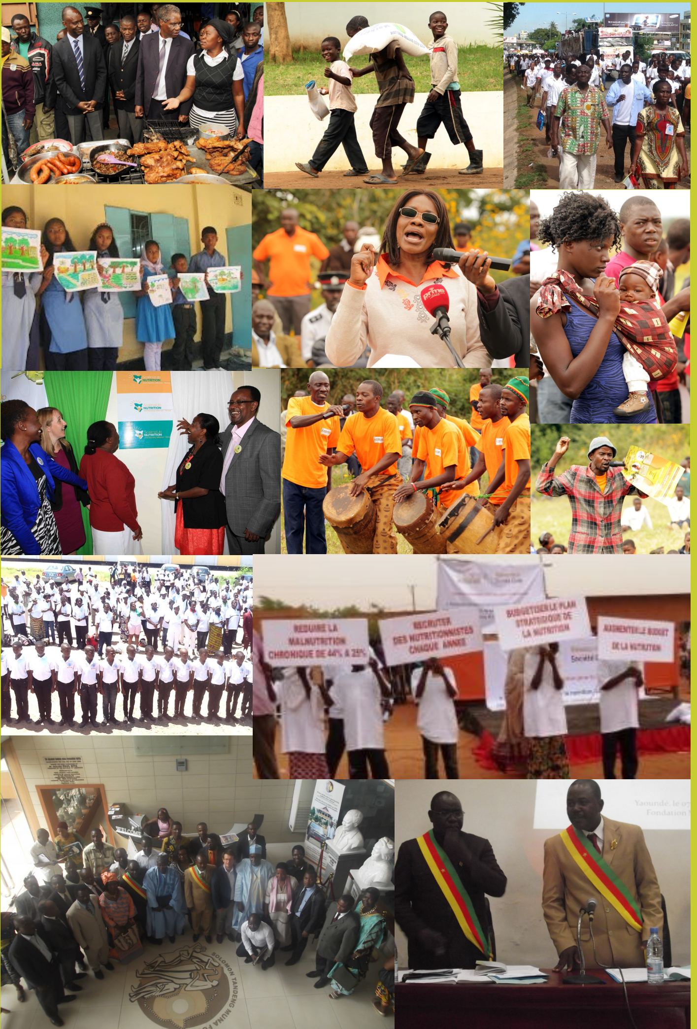
Photo Credit—Tous Uni pour la Nutrition—Niger (TUN-Niger), Zambia Civil Society Organization Scaling Up Nutrition (CSO-SUN) Alliance, Ghana Coalition of Civil Society Organizations for Scaling Up Nutrition (GHACCSUN), SUN Civil Society Alliance Kenya, Cameroon - Global Day of Action 2014