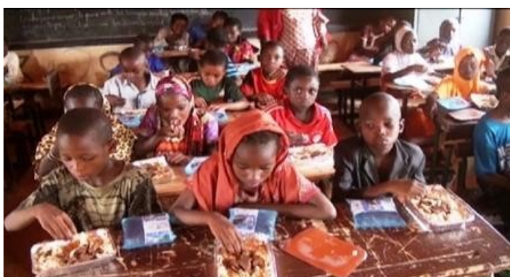
Photo Credit—Tous Uni pour la Nutrition—Niger (TUN-Niger) Global Day of Action 2014