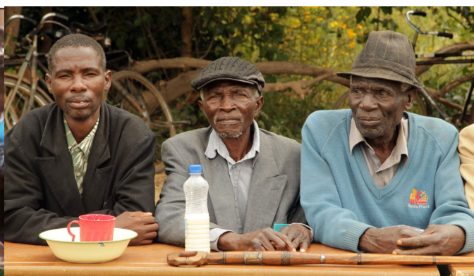
Photo Credit—Zambia Civil Society Organization Scaling Up Nutrition (CSO-SUN) Alliance Global Day of Action 2014