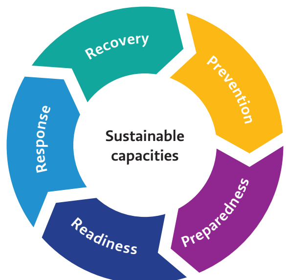
Fig. 1. The full emergency management cycle

Prevention, preparedness, readiness, response and recovery exist on a continuum (Fig. 1). Countries that had invested in preparedness in the wake of past health emergencies such as Ebola virus disease and severe acute respiratory syndrome (SARS), including adoption of a coordinated multisectoral approach, community engagement and improvements to infection prevention and control in the community and in health care facilities, have been better able to prevent and control subsequent disease outbreaks, including the current COVID-19 pandemic 5, 6 .