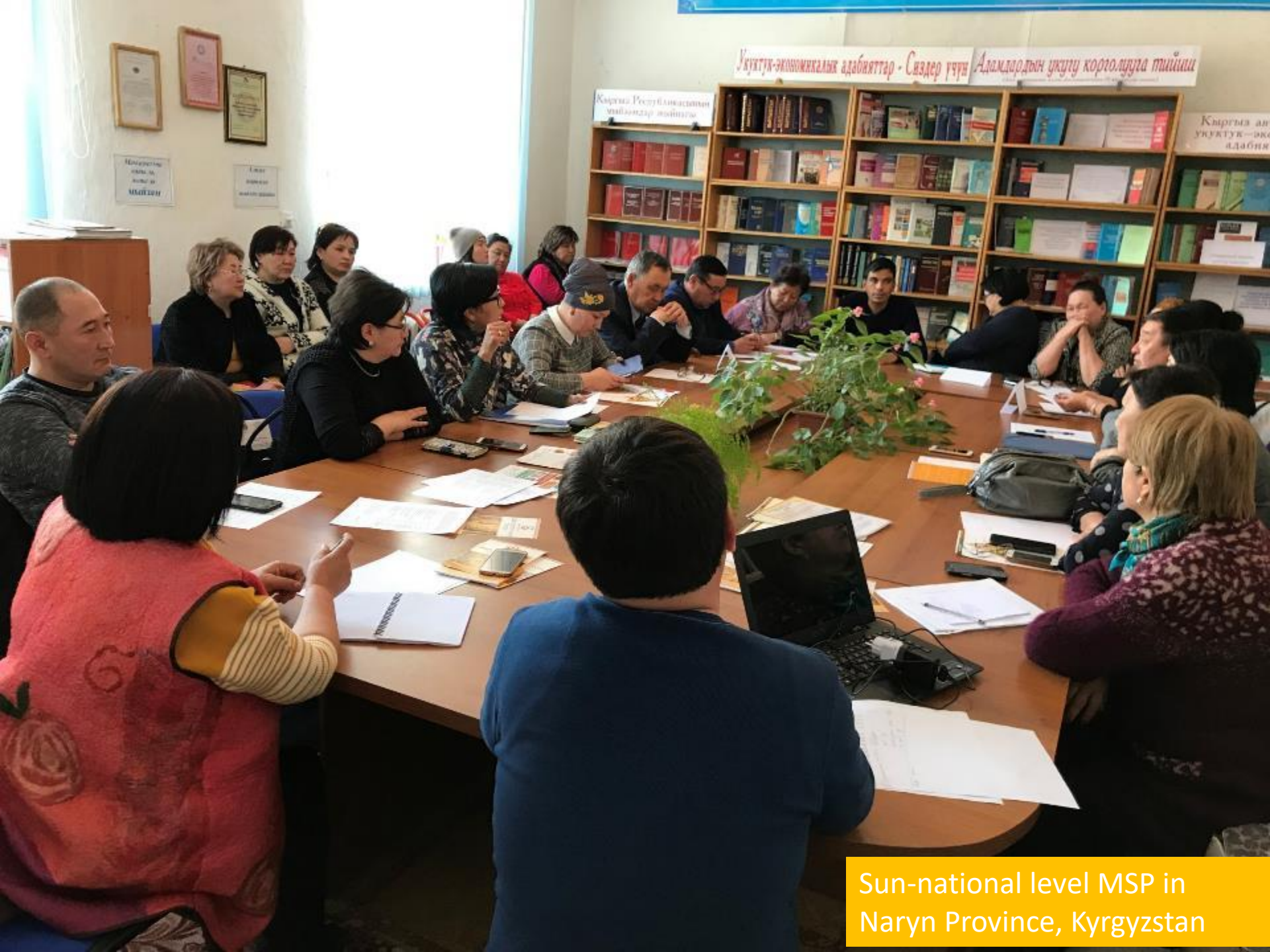
Sun-national level MSP in Naryn Province, Kyrgyzstan