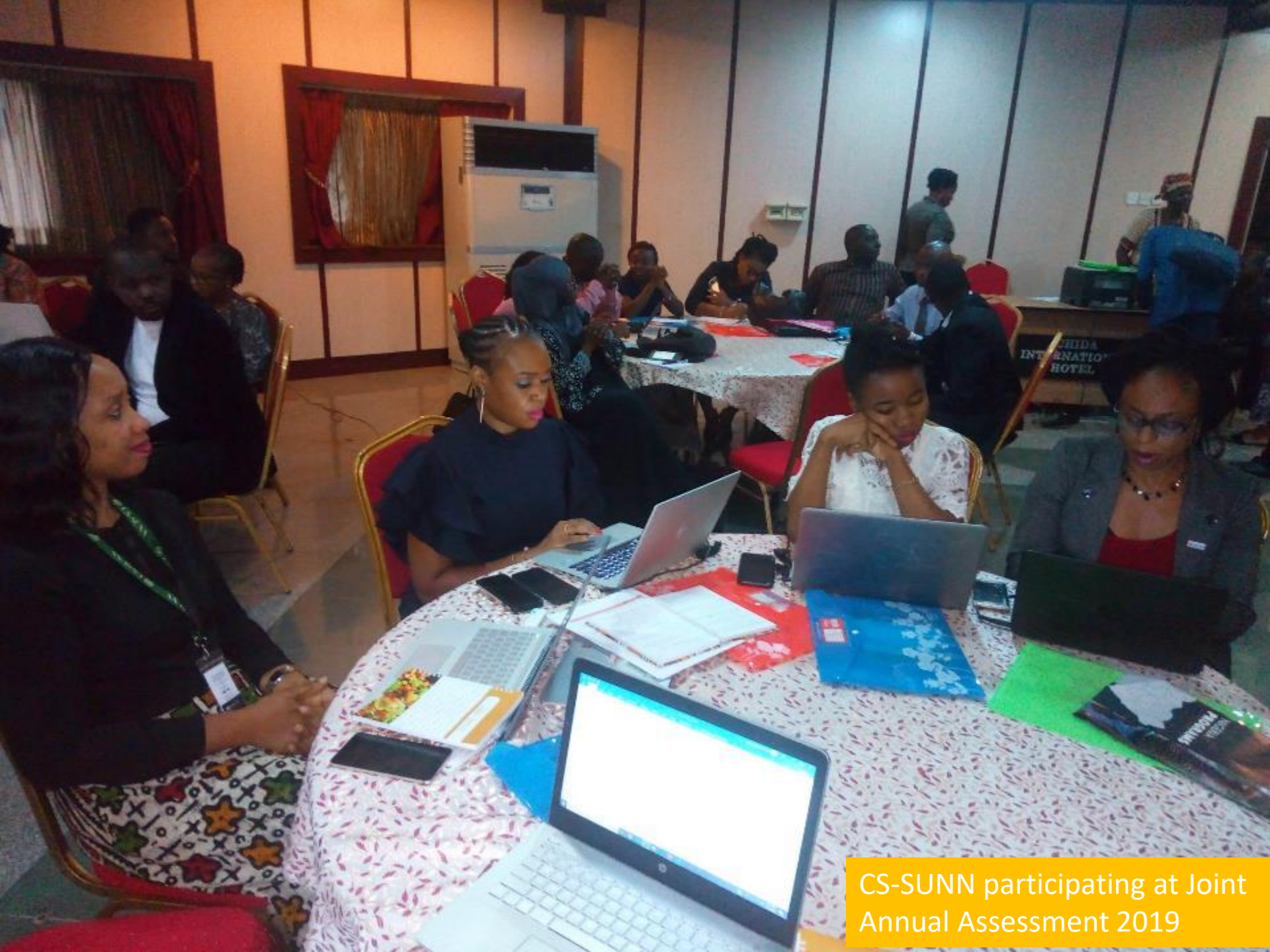
CS-SUNN participating at Joint Annual Assessment 2019